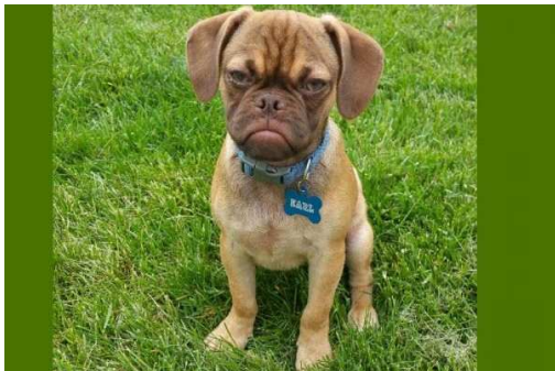
Facial Expression Says it All Grumpy Dog and Grumpy Cat

You wanted the companionship and love that a dog gives in exchange for very little. Even when the dog gets nothing, she still wants to hang out with her people. What other friendship works on those terms? It really isn't asking too much for you to spend some dedicated one-on-one time with her.