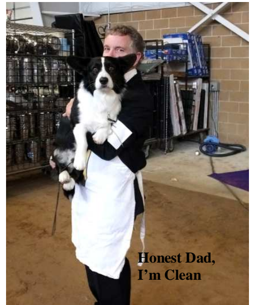
Honest Dad, I'm Clean