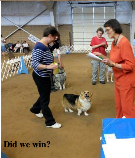
Did we win?