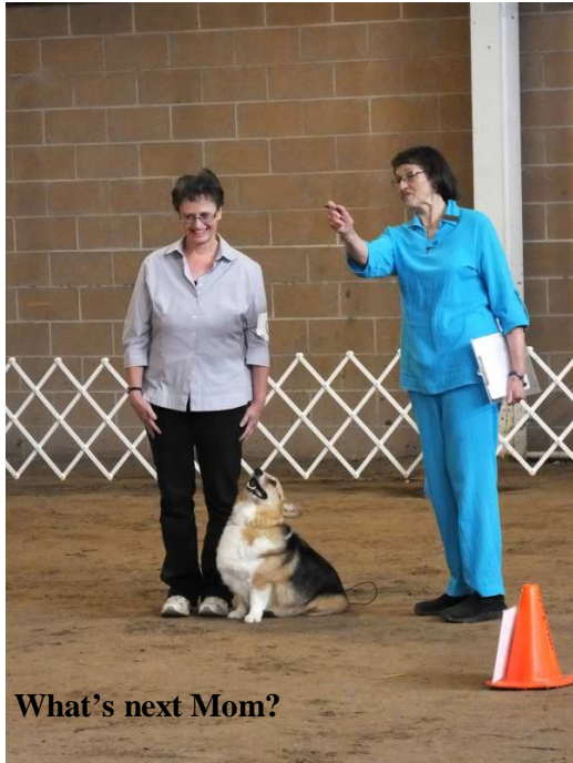
What's next Mom?

I love getting photos for the Newsletter!