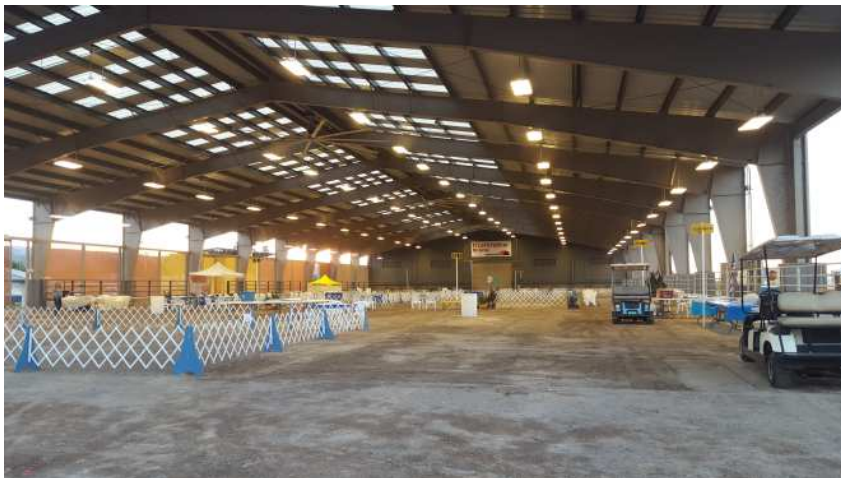
Great photo of our new arena.