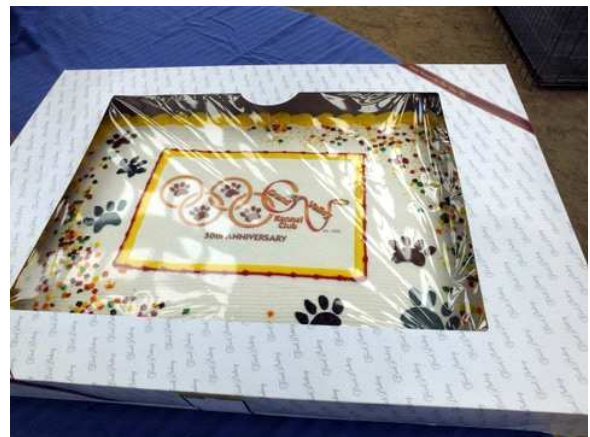
We even let everyone eat cake