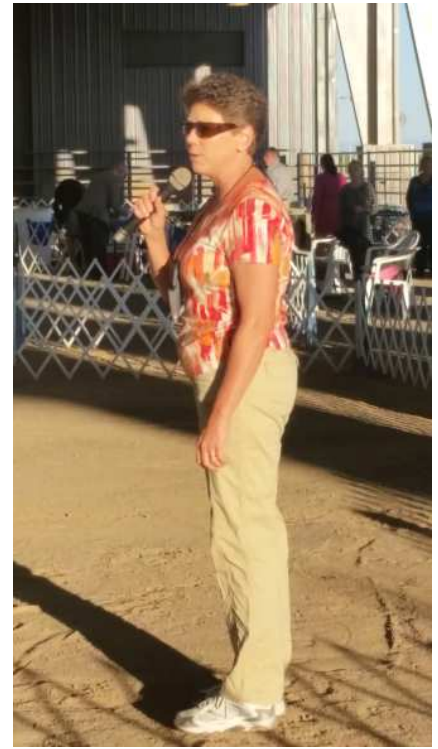
Good Morning Announcements