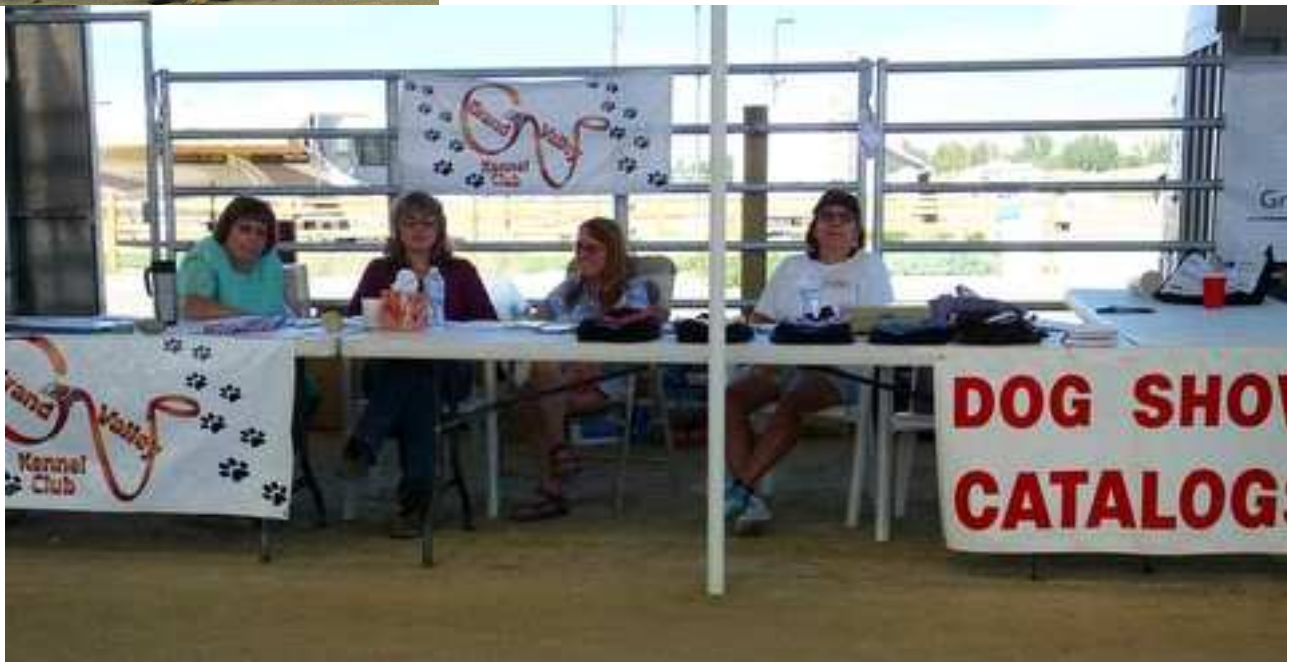
Catalog Table, where all of the Catalog sales happen, Stewards get their assignments, trophies are handed out, and problems are solved.

A SPECIAL THANKS TO ALL OF OUR VOLUNTEERS. A WONDERFUL GROUP