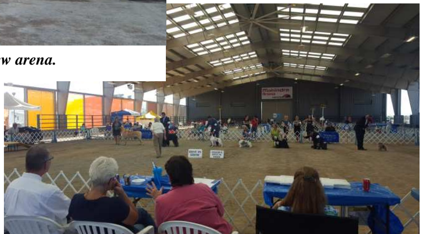
Best in Show Thursday